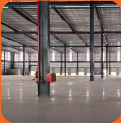
PUMP ROOM & FIRE TANKS