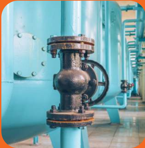
SEWAGE TREATMENT PLANT (STP)

Our Built-To-Suit-Logistics model grants you the unique opportunity to determine the desired size of your warehouse.