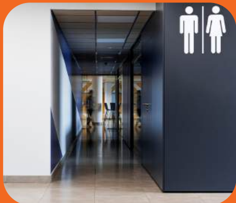
DRIVER REST ROOMS